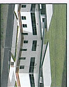
Customers are welcome to visit Dental Service Direct's new site

AFTER a long time searching for the perfect location, Dental Services Direct is delighted to announce the recent opening of a new Blackburn based northern office and showroom. Conveniently situated for both motoway and major road links, the building offers a base for the customer services team